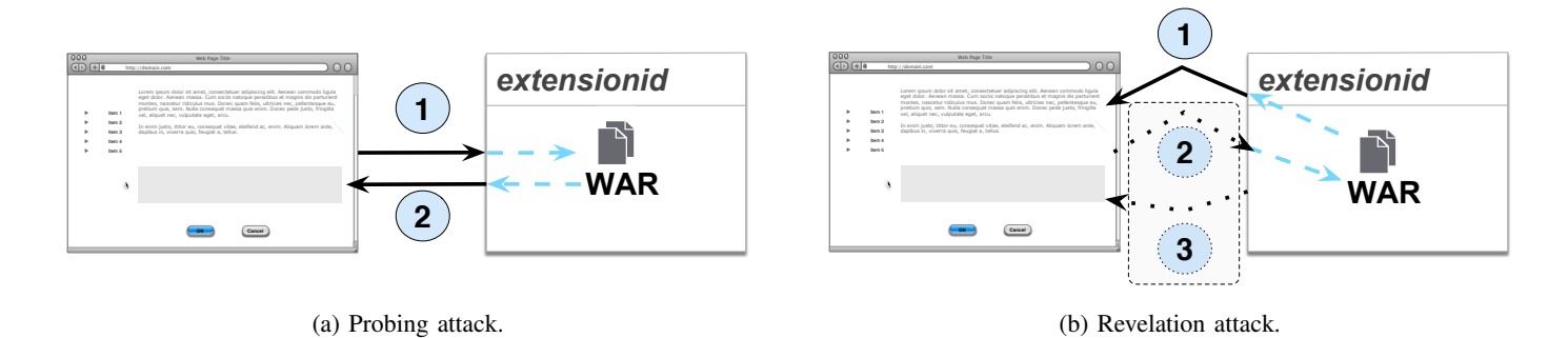
Fig. 1: Schematic overview of the extension probing attack and extension revelation attacks. In the probing attack, a web page probes for the presence of an extension. In the revelation attack, the extension reveals itself to the attacker by injecting content in the web page.

many or even all installed browser extensions.